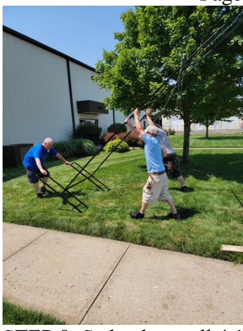
STEP 8: Stake down all 4 16' guide wires