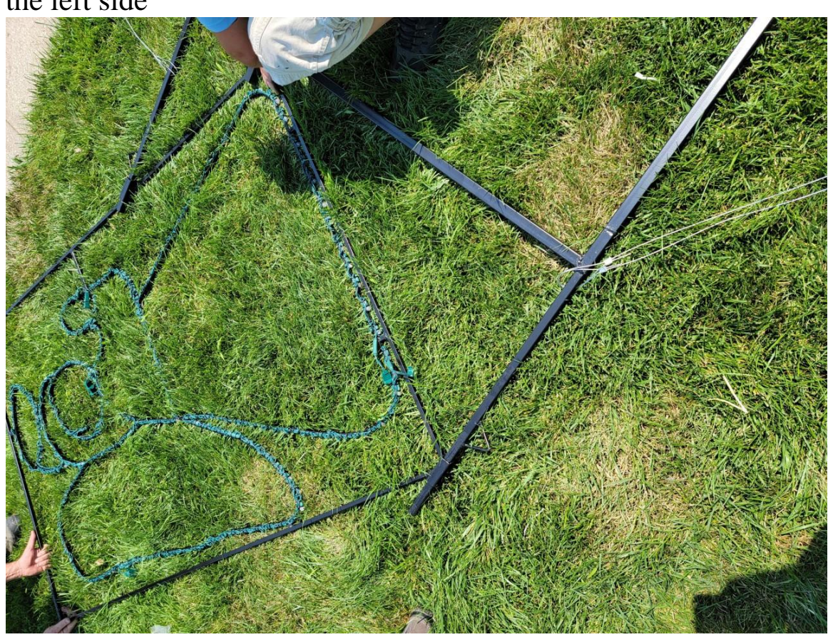
STEP 4: Make sure the Angel Gabriel frame has a short support on the left side

Note that Angel Gabriel slants to the left side as Angel Gabriel is looking over the Manger and talks to Mary